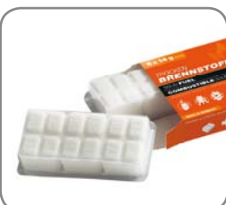
Refills Art. No.: 001 121 00