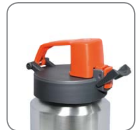
Closure opens by quick release button