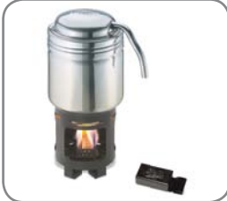
Suitable for 20102400