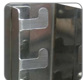
Adjustable in height, 2 levels

Size packed ..... ~ L 65 x W 155 x H 245 mm Size built-up ..... ~ L 135 x W 155 x H 245 mm Weight ..... ~ 1450 g