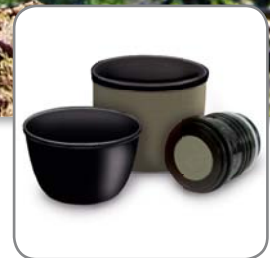
Lid (serves as mug), extra mug and closure

Made of high-quality stainless steel · Double-walled · 2 drinking mugs · 2 screw plugs - with and without push button for pouring function · Coated inner body for especially good heat preservation