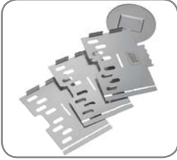
Ultra light, 5 Parts