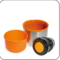
Lid (serves as mug), extra mug and closure

ART. NO.: ISO500ML ART. NO.: ISO750ML ART. NO.: ISO1000ML