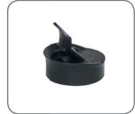
Additional lid with closable drinking opening