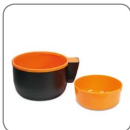
Lid (serves as mug), extra mug and closure