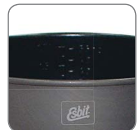
Multilayer non-stick coating