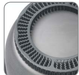
With heat exchanger