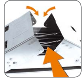
Charcoal can be stored inside the grill