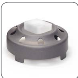
Mat for solid Fuel included