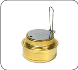
Suitable for use with AB300BR

With a practical nylon bag. Can be packed with up to 6 x 14 g solid fuel tablets. Not included.