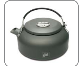
Suitable for WK600HA in combination with CS2350HA