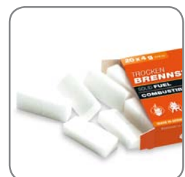
To be lit with 20 x 4 g solid fuel (not included)