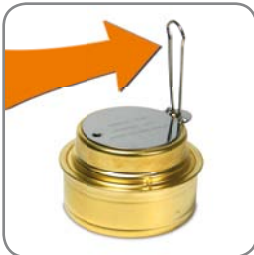
Alcohol Burner with foldable handle