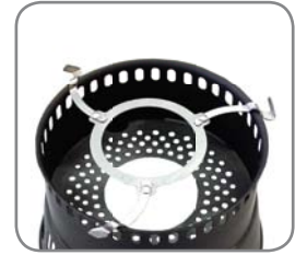
In combination with stove set CS2350HA