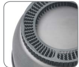
2.35 L pot with heat exchanger