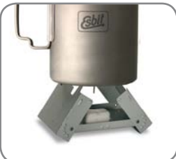
Alternative cooking position