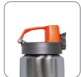
Closure with carrying handle