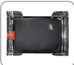
Bag can be stored inside grill