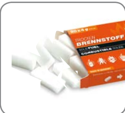
Refills Art. No.:00102000