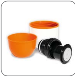
Lid, extra mug and closure