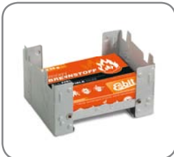
Contained in 00209000