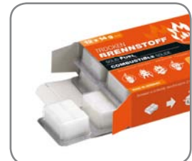
Refills Art. No.: 001 012 00