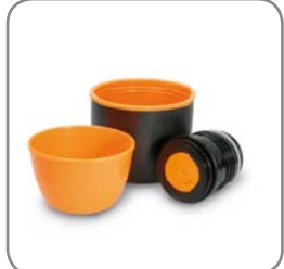
Lid (serves as mug), extra mug and closure

ART. NO.: VF350ML ART. NO.: VF500ML ART. NO.: VF750ML ART. NO.: VF1000ML