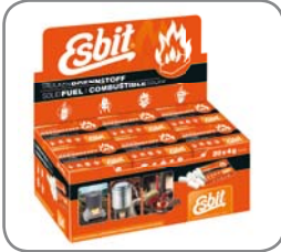
20x4g solid fuel tablets