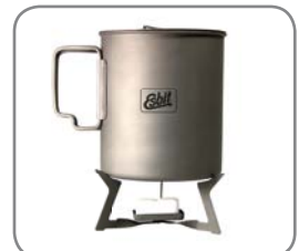
Suitable for PT750-TI (not included)