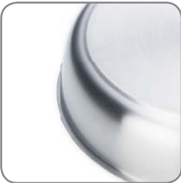
Bottom of pan with aluminium coating