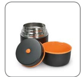
Food jug open